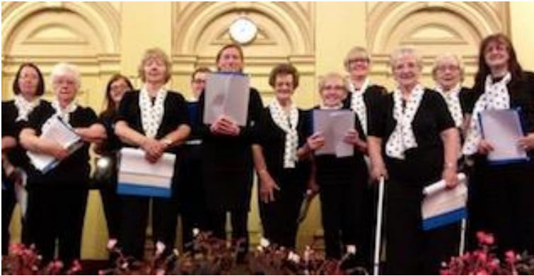
Pictured: Choir members on-stage

“Singing with the choir helps me in so many ways; it gives me a break from my caring responsibilities and the chance to be with others who are or have been carers. Singing makes me feel happy, it has increased my confidence and self-belief.”