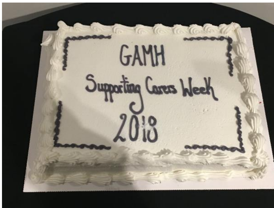
Pictured: Glasgow Association of Mental Health cake which was on display at the event

The event had capacity for 60 people and was attended by carers, service users and professionals, all present heard about services that support carers while also giving them the opportunity to listen to those with experiences of caring provide their thoughts and experiences of using the service.