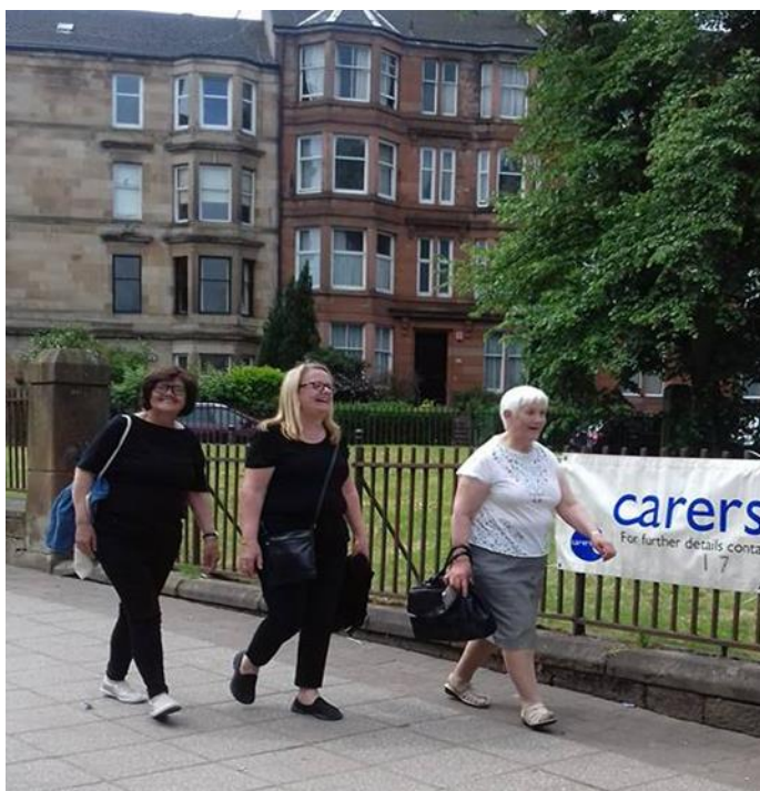
Pictured: Participants enjoying a walk around the local area

With the theme of the session being to Supporting Carers to be Healthy and Connected , activities included taking part in either a 1k or 5k walk around the local area. This great opportunity was taken up by around 40 carers who joined one of the walks then heading to the Dixon Centre for a healthy lunch over which everyone had a chance to continue conversations started while pounding the pavements.