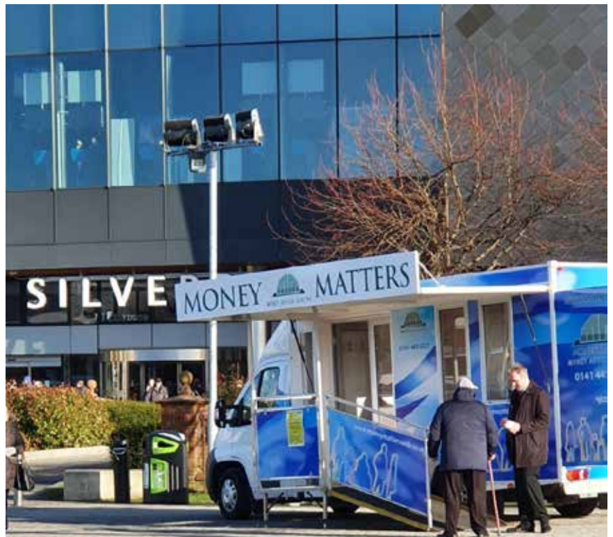
Pictured: The Money Matters bus at Silverburn.

More information http://moneymattersweb.co.uk/news/are-your-clients-fab-or-fat/