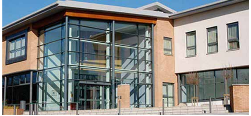
Pictured: Gartnavel Royal Hospital.

The hospital's Intensive Psychiatric Care Unit (IPCU) has gained the Quality Network for Psychiatric Intensive Care Unit. The Royal College of Psychiatrists awarded the team with accreditation for demonstrating best practice and excellence in care.