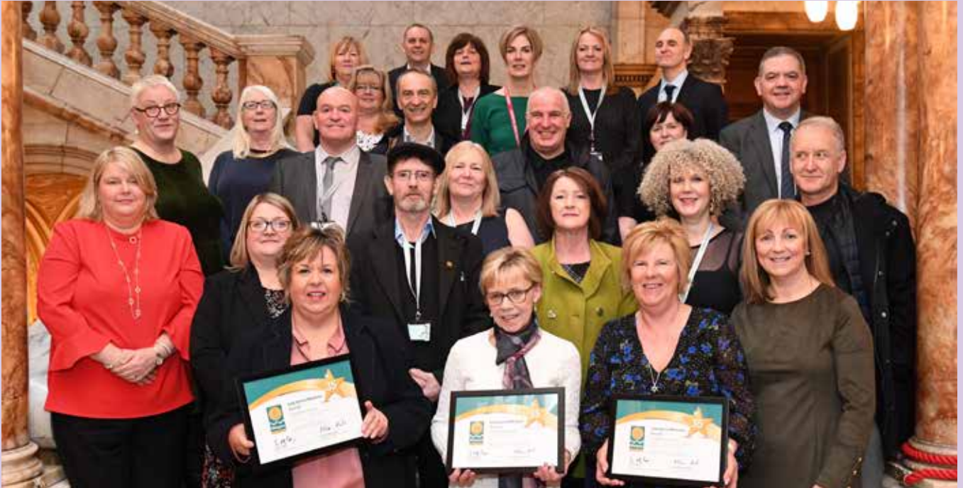
Pictured: Staff with 35 years service with members of the Glasgow City HSCP Senior Management Team.

Almost 200 of our long serving Social Work staff had their dedication to public service recognised on 19 February at this year's Social Work Services Long Service Milestone Awards. The Awards recognise Social Work staff reaching a milestone service length of 25, 30, 35 and 40 years' service during the 2018 -19 financial year.