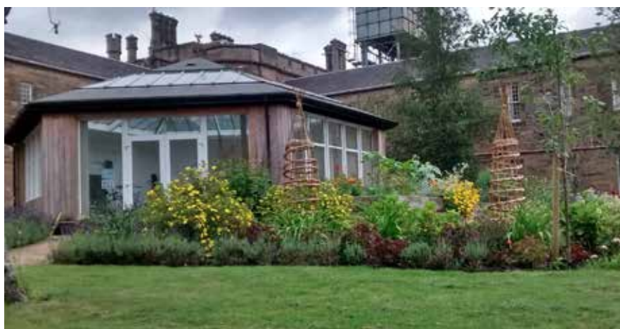
Pictured: The Summerhouse and Raised Beds of The Growing Spaces.

The Growing Spaces benefit from corporate volunteer involvement where many hands are needed. Organisations such as Macmillan Cancer Support, EVERIS, SQA, the Clydesdale Bank and ARGOS are just a few of the organisations who have contributed time, effort and funds to help refurbish patient garden spaces.