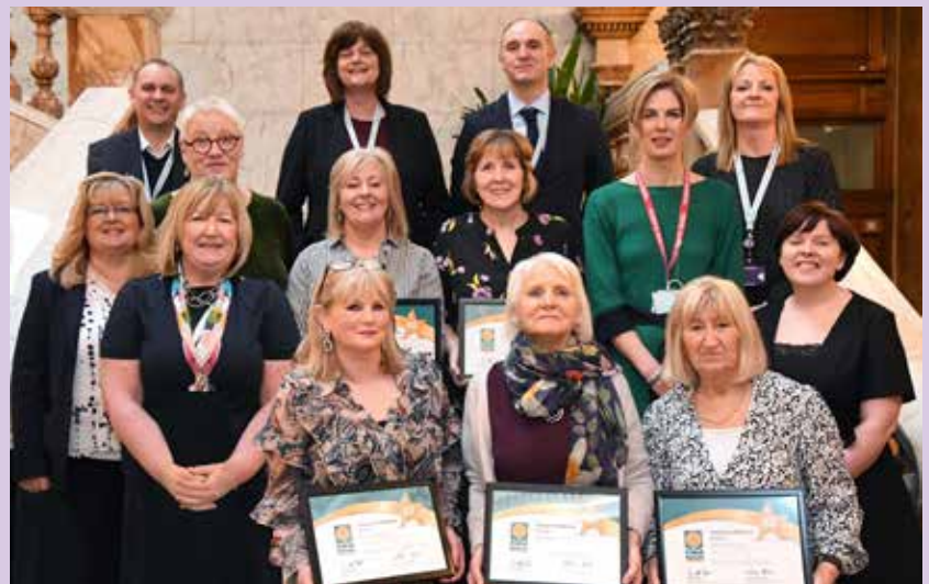
Pictured: Staff with 40 years service with members of the Glasgow City HSCP Senior Management Team.

City Convener for Health and Social Care, Glasgow City Council, and Senior Management Team Members joined the event to recognise and celebrate the significant achievement of long service staff.