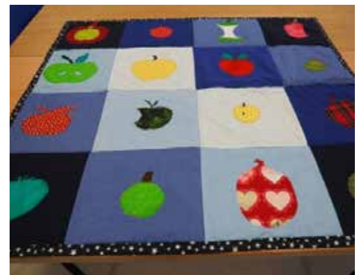
Pictured: Quilted wall hanging.

The Occupational Therapy Creative Therapies group completed a project with patients from the adult acute wards over a period of 18 months to produce art pieces centred on the theme of 'apples.' The theme was drawn from the name Gartnavel, which means 'Field of Apples' in Gaelic. The group supported recovery by using art to give patients a sense of achievement, develop self-confidence and develop skills such as concentration, decision making, communication and problem solving. One of the main pieces of art created was a quilted wall hanging made up of individual squares designed and produced by individuals.