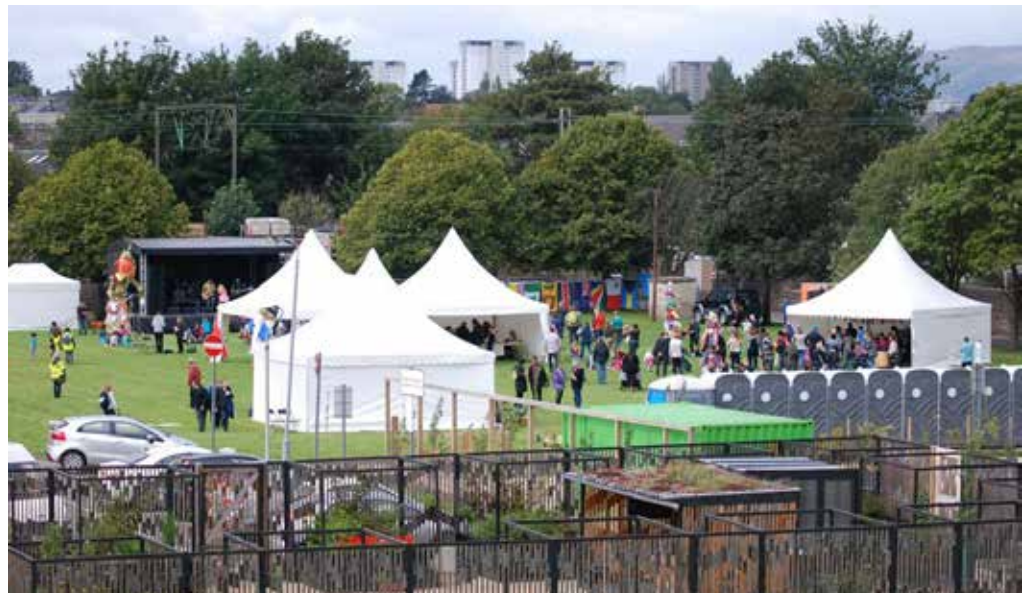
Pictured: The Over the Wall Festival of Neighbours at Gartnavel Royal Hospital.

If you are interesting in learning more about getting involved in the creative volunteer programme, please contact Fiona.Sinclair6@ggc.scot.nhs.uk , or phone on 0141 211 3681.