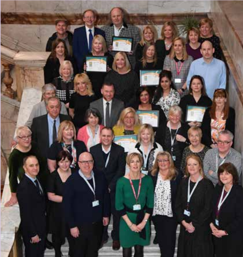
Pictured: Staff with 30 years service with members of the Glasgow City HSCP Senior Management Team.