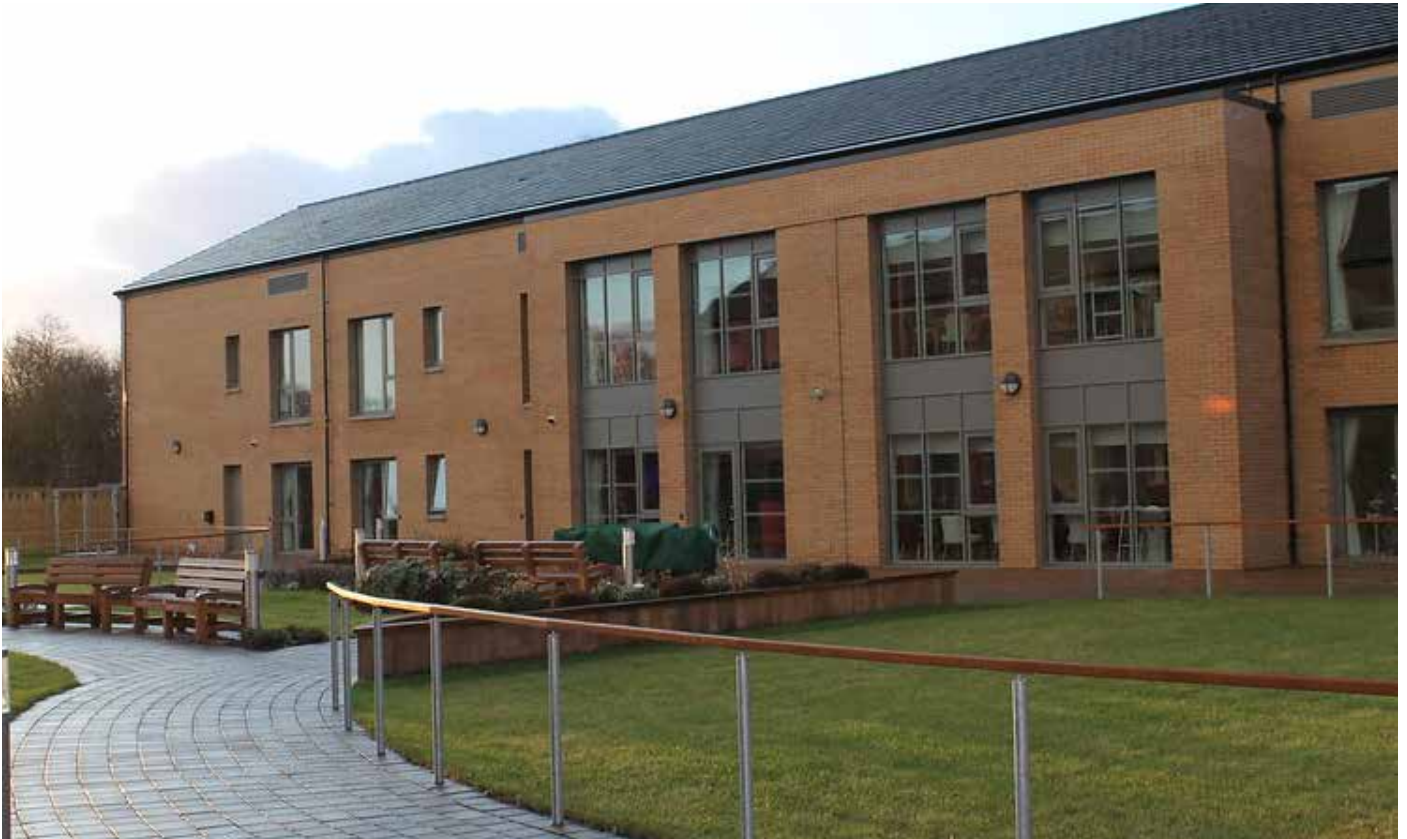
Pictured: Victoria Gardens Care Home.

Residents of two former Glasgow care homes are settling into a stunning new facility built as part of an £112.5million investment programme. Victoria Gardens is a new 70 bed care home built on the site of the former Blawarthill Hospital in Knightswood, provided by Glasgow City HSCP. It is one of five new care homes built across the city to replace old, outdated facilities.