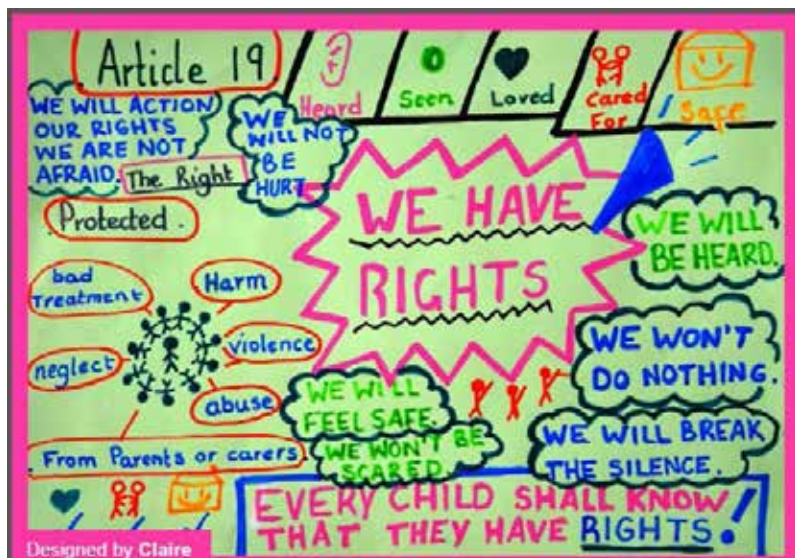
Pictured: Some of the winning designs.