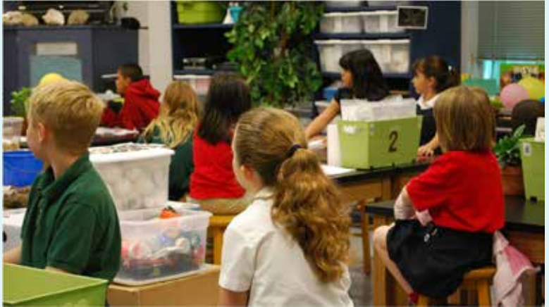
Pictured: Pupils using the new resource.

On behalf of a national partnership, the Health Improvement Team within Sandyford Sexual Health Services commissioned and led the development of the new national Relationships, Sexual Health and Parenthood (RSHP) online teaching and learning resource that is now available at https://rshp.scot/