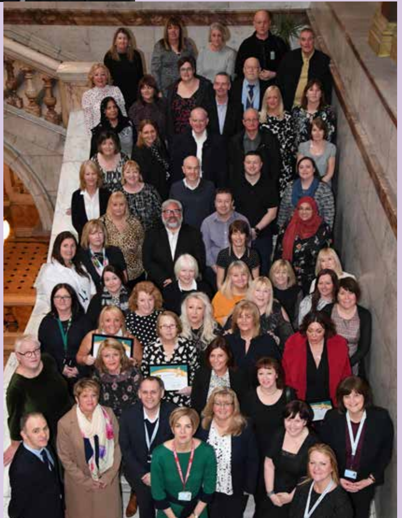
Pictured: Staff with 25 years service with members of the Glasgow City HSCP Senior Management Team.