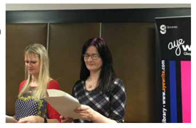
Pictured: Aye Write Participants

Restart is a NHSGGC mental health project that works with Glasgow City Health and Social Care Partnership's Community Mental Health Teams. The main focus of the project is to offer recovery-based support to those living with severe and enduring mental health conditions.