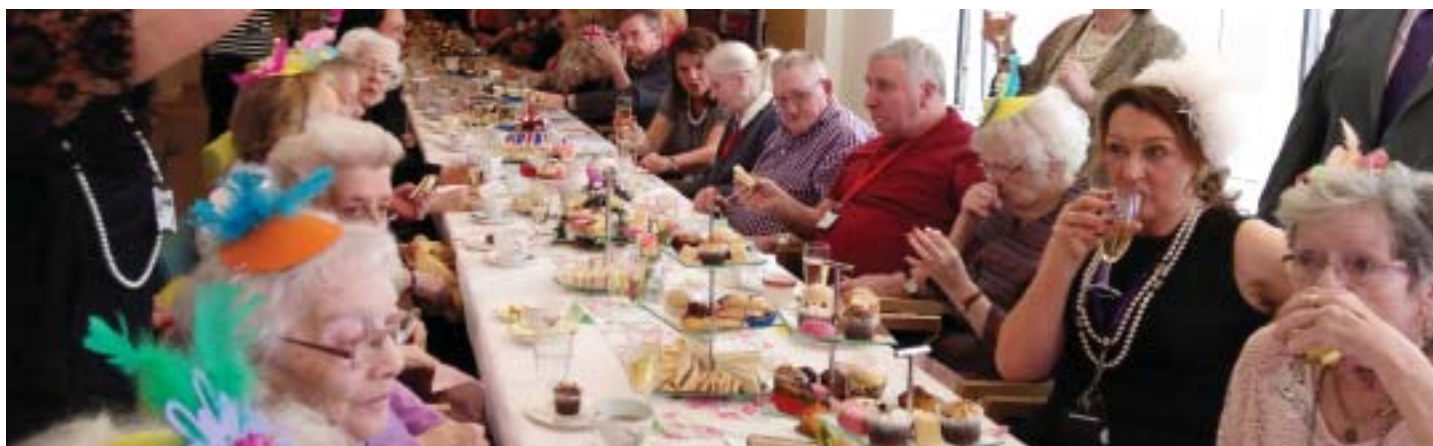
Residents and staff from Orchard Grove attending the tea party