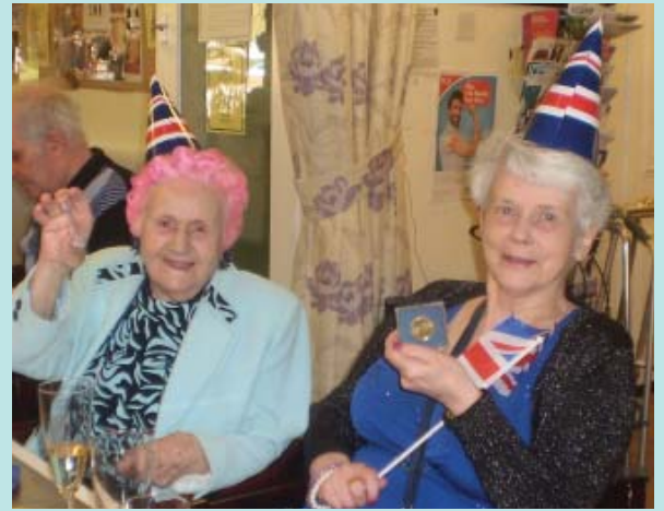
Residents in Forfar Avenue with their Commemorative Coin