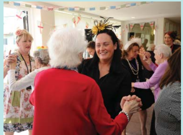
Residents and staff dancing in Orchard Grove