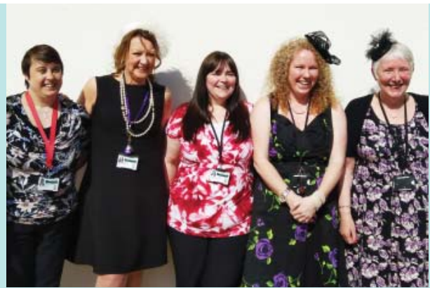
Staff at Orchard Grove dressed for the event

On the day of the event, the sun was shining and hairdressing salons within the homes were fully booked as residents got ready. Elsewhere in the care homes, support staff were creating a street party atmosphere and Cordia staff were busy making sandwiches and baking cakes for the big event. Some staff also got into the spirit by dressing according to the theme.