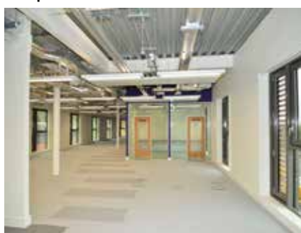
2nd Floor Office Accommodation