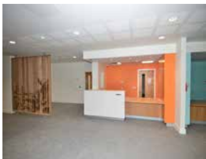
GP Reception Area

Eight GP Practices, Children's Specialist Service – Children and Adolescence Mental Health Service (CAMHS) and Community Paediatrics Including Speech and Language Therapy