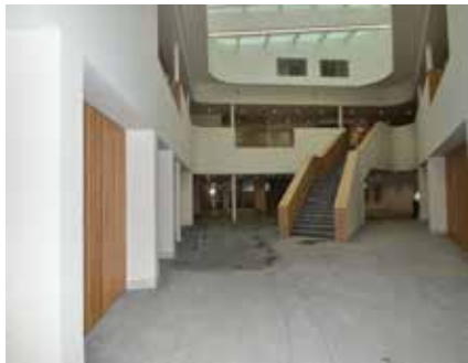
Main Foyer/Waiting Area

Community Reception, Treatment Room, Podiatry and Physiotherapy, District Nurse and Health Visiting, Community Clinics and Outreach services including SPHERE; Diabetic Nursing; Anticoagulant; Primary Care Mental Health Service; Social Work; Money Advice and Health Improvement services, Pharmacy and General Dentist.