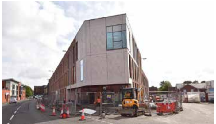
Doncaster Street/Garscube Road Main Entrance

Woodside Health and Care Centre 891 Garscube Road Glasgow G20 7ER