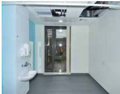
One of the Treatment Rooms