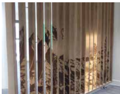
Screen at GP Waiting designed by Bespoke Atelier