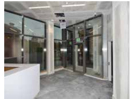
Alcohol and Drug Recovery Services Waiting Area