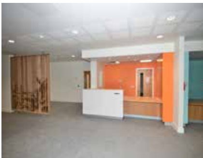
GP Reception Area

Eight GP Practices, Children's Specialist Service – Children and Adolescence Mental Health Service (CAMHS) and Community Paediatrics Including Speech and Language Therapy