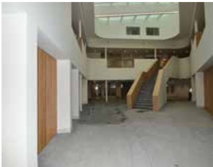
Main Foyer/Waiting Area

Community Reception, Treatment Room, Podiatry and Physiotherapy, District Nurse and Health Visiting, Community Clinics and Outreach services including SPHERE; Diabetic Nursing; Anticoagulant; Primary Care Mental Health Service; Social Work; Money Advice and Health Improvement services, Pharmacy and General Dentist.