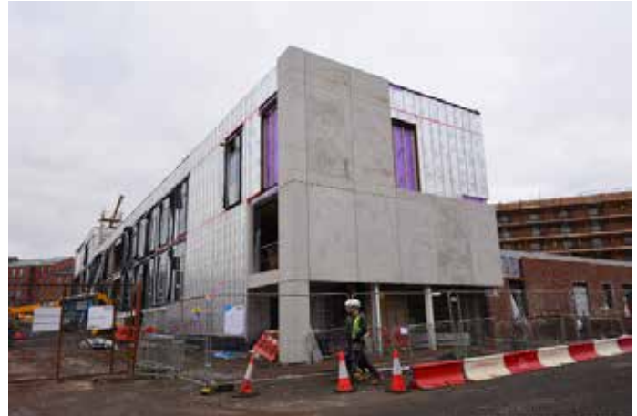
Site construction image.

The new Woodside Health and Care Centre development is still on schedule for completion and 'hand over' from the contractor by the end of 2018. The precise dates for services to be operational within the new facility will be confirmed in due course. The work being progressed presently are the internal walls, pipes, heating and electrics with the internal 'finishes' of the flooring, fitments, plaster board etc scheduled for later in the year. After the building is completed the system and services will be fully tested and the building cleaned and furnished to ensure a smooth transfer for patients, staff and visitors to the new centre. The new address for Woodside Health and Care Centre is 891 Garscube Road, Glasgow, G20 7ER. The new telephone numbers and transfer date will be widely publicised when available.