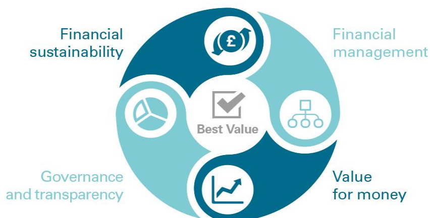
Exhibit 5 Audit dimensions